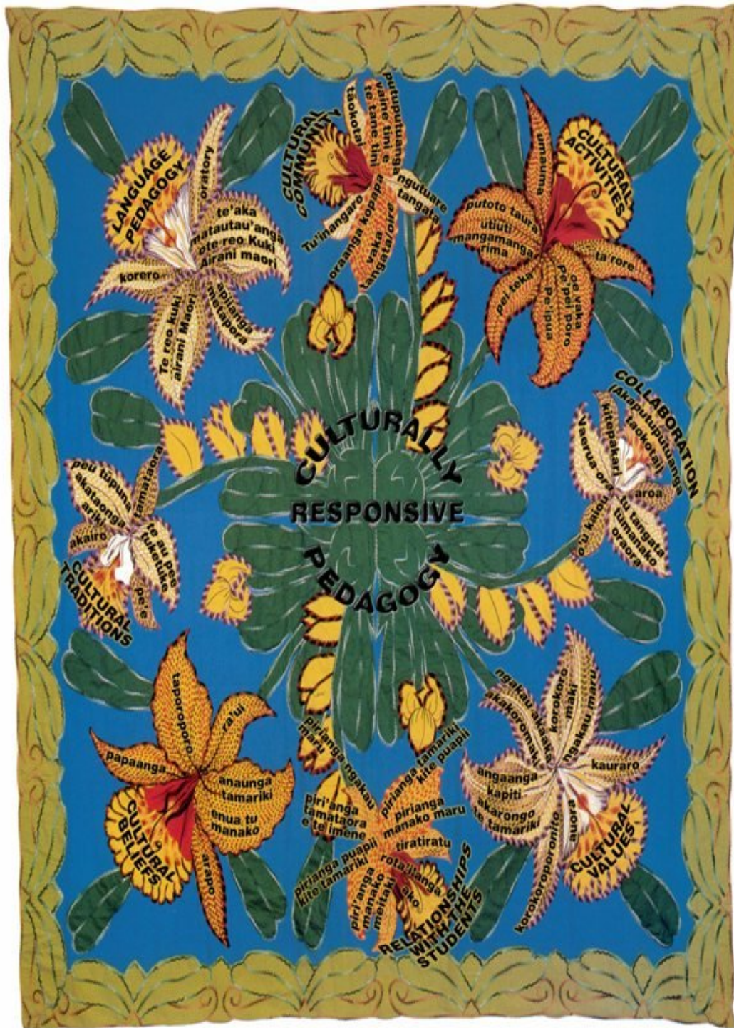
Figure 2: Based on Rongokea's (2001) book, the author created a tivaevae model as a conceptualised theoretical framework for a culturally responsive pedagogy in Cook Islands physical education (Te Ava, 2011).